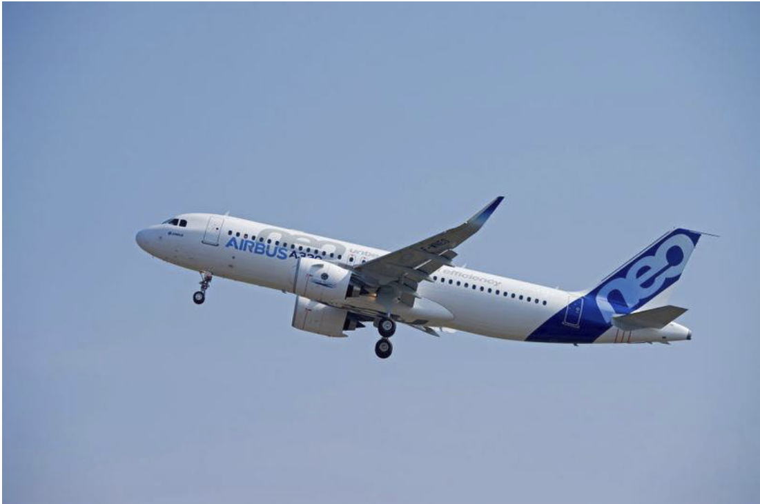
AIRBUS A320-200 NEO